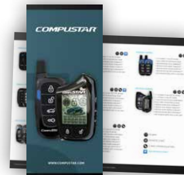
COMPUSTAR PRODUCT BROCHURE SKU: COMPUSTAR BROCHURES

Full colour, tri-fold brochure featuring the remotes and companion remotes of the 2017 Compustar Pro line.