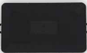
TRANSPONDER BYPASS SKU: COMPUTRANS

The FT-ALARMIT KIT makes it easier than ever to add an advanced security and alarm system to your existing Compustar remote starter. Includes an FT-DAS Shock Sensor, an FT-SIREN Alarm Siren and an FT-LED BLUE Theft Deterrent LED.