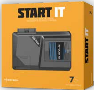
7 SERIES START IT STARTER CONTROLLER SKU: FT-7200S-CONT

THE FIRSTTECH 7 SERIES CONTROL MODULES OFFER THE WIDEST RANGE OF CUSTOMIZABILITY FOR ADDING REMOTE START AND SECURITY FEATURES TO OVER 90% OF VEHICLES ON THE ROAD. ALL OF THE SYSTEMS ARE BACKED BY FIRSTTECH'S LIMITED LIFETIME WARRANTY.