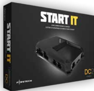
DC2 START IT DATA CONTROLLER SKU: FT-DC2-S