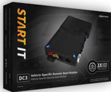
DC3 START IT DATA CONTROLLER SKU: FT-DC3-S