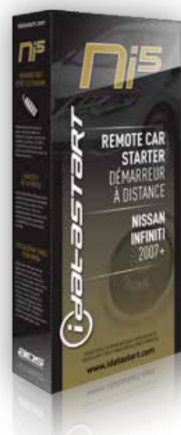
INFINITI, NISSAN SKU: ADS-RS-NI5 201 Models, 2007 ~ 2017