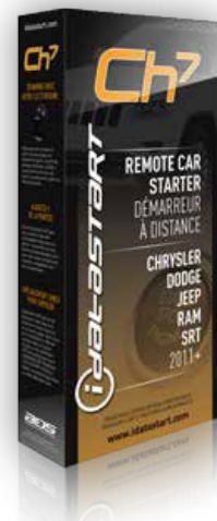
CHRYSLER, DODGE, RAM, JEEP SKU: ADS-RS-CH7 187 Models, 2011 ~ 2018