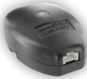
SHOCK SENSOR SKU: 2WFM-AS/S

With the FT-RPS-TOUCH mounted on your windshield, you can arm your Compustar alarm simply by pressing the red button on the RPS-TOUCH. A 4-digit code is all you need to disarm your alarm and unlock your doors. The FT-RPS-TOUCH also doubles as a 2-way remote pager.