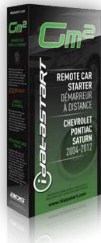
CHEVROLET, PONTIAC, SATURN SKU: ADS-RS-GM2 102 Models, 2004 ~ 2012