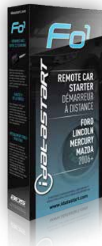
FORD, LINCOLN, MAZDA, MERCURY SKU: ADS-RS-FO1 316 Models, 2006 ~ 2017