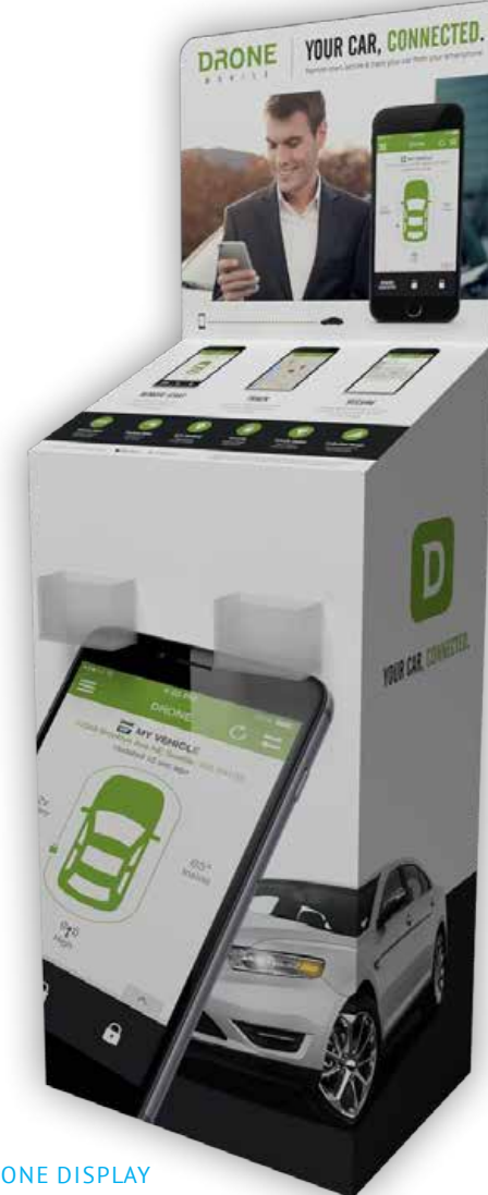
DRONE DISPLAY SKU: P-DMDISPLAY-2015

Standing Compustar Remote Start display which measures 36" wide, 24" deep and 73" high, featuring six remotes of your choice and product display cards with pricing (download template from www.staub.ca/remotestart ).