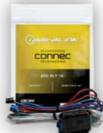
1A RELAY - 4/PACK SKU: ADS-RLY-1A

Ideal for various low current applications, the ADS-RLY A1 multipurpose 1 Amp relay kit can also be combined with our ADS-RNG products for low cost RF transponder bypass applications. Product sold as 4-pack.