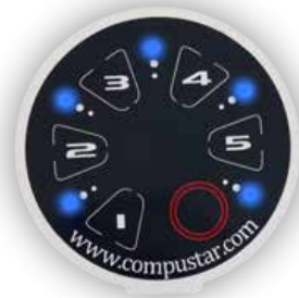
VEHICLE PAGING SENSOR SKU: RPS TOUCH

The FT-DAS gives you 3 different sensors in one. Along with a dual stage shock sensor, the FT-DAS includes tilt and G-force sensors, which shut down the vehicle when it senses movement and notifies you on your 2-way remote. A perfect solution for installing onto manual transmission vehicles.