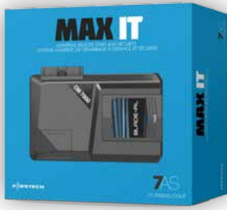
7 SERIES MAX IT ALARM/STARTER CONTROLLER SKU: FT-7000AS-CONT