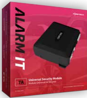
7 SERIES ALARM IT ALARM CONTROLLER SKU: FT-7300A-CONT