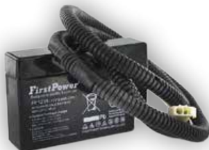
BACKUP BATTERY SKU: FT-BATT-BACKUP

The Computrans V2 is used when installing remote start products in vehicles equipped with a Radio Frequency based immobilizer system. This type of system uses a small chip imbedded in the ignition key, called a transponder, to transmit a very low powered RF signal. If your vehicle has this type of security system, you will need this type of bypass module.