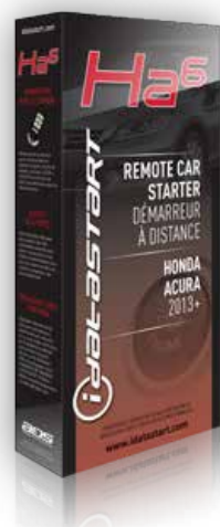
HONDA, ACURA SKU: ADS-RS-HA6 38 Models, 2013 ~ 2017