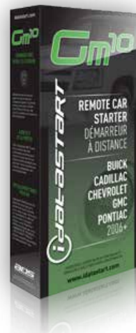
CADILLAC, CHEVROLET, BUICK, GMC, PONTIAC SKU: ADS-RS-GM10 517 Models, 2006 ~ 2017