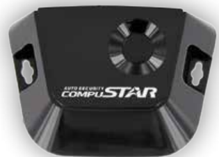
DIG. ADJUSTABLE SENSOR SKU: FT-DAS

Ideal for various low current applications, the ADS-RLY A1 multipurpose 1 Amp relay kit can also be combined with our ADS-RNG products for low cost RF transponder bypass applications. Product sold as 4-pack.