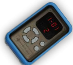
OPTIONAL PROGRAMMER SKU: OPTION PRO

The FT-BATT-BACKUP provides an extra three hours of battery power to all alarm functions even if your car loses power. The system connects to your CM5/CM6/CM7 Series alarm or alarm starter. Provides backup battery power to all alarm functions for the duration of the battery's life. Ideal for protecting your car even when the primary battery power is cut off.