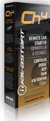
CHRYSLER, DODGE, RAM, VOLKSWAGON, JEEP SKU: ADS-RS-CH4 217 Models, 2007 ~ 2017