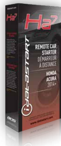
HONDA, ACURA SKU: ADS-RS-HA7 30 Models, 2014 ~ 2017