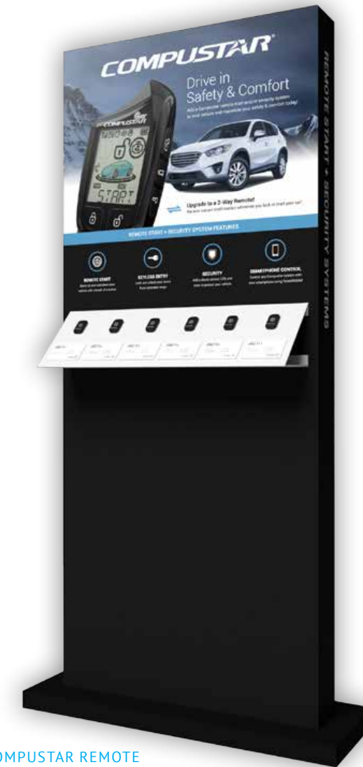
COMPUSTAR REMOTE START DISPLAY SKU: P-RSDISPLAY-2016

Full colour, tri-fold brochure featuring the remotes and companion remotes of the 2017 Compustar line.