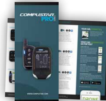
COMPUSTAR PRO PRODUCT BROCHURE SKU: COMPUSTAR PRO BROCHU

Full colour, tri-fold brochure featuring the remotes and companion remotes of the 2017 Compustar Pro line.