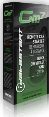
BUICK, CHEVROLET, GMC SKU: ADS-RS-GM7 178 Models, 2010 ~ 2017