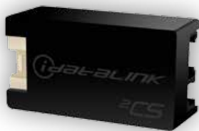
RF DECODER SKU: FT-D100

This harness is used to switch the lock and unlock outputs on the CM3 and CM4 series control modules. The harness provides a 600 mA positive 12V+ on the lock and unlock wires. The DM600 plugs directly into the current lock harness on the CM3 and CM4 series.