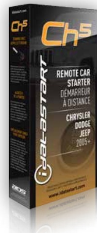
CHRYSLER, DODGE, RAM, MITSUBISHI, JEEP SKU: ADS-RS-CH5 190 Models, 2005 ~ 2017