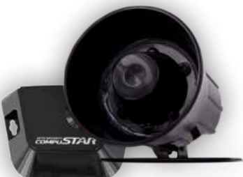
ALARM ACCESSORY KIT SKU: FT-ALARMIT-KIT

The FT-D100 Decoder is a translator that allows Firstech radio frequency kits (RF) to communicate with the iDataLink ADS-AL-CA Universal Transponder/Doorlock Interface using Remote Start firmware (RS) from ADS.