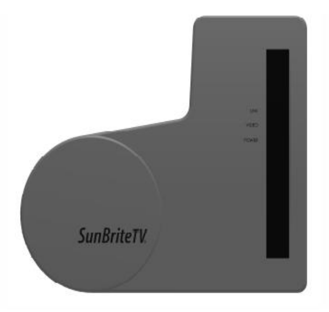
Receiver - Front View